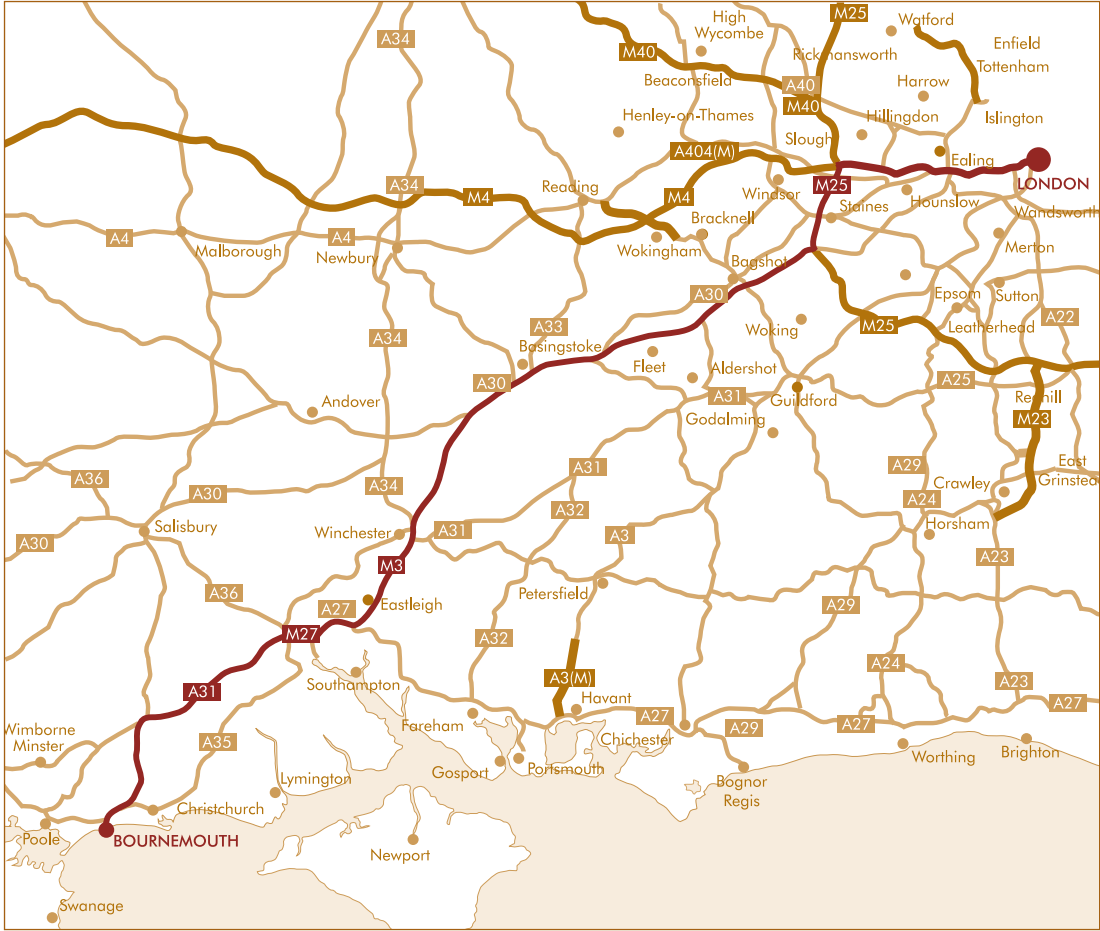
Area Map - From London > 34 Gervis Road, Bournemouth BH1 3DH